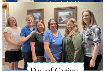
Day of Caring