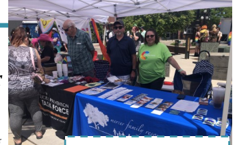
Casper PRIDE Fest