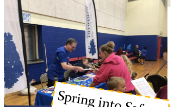
Spring into Safety